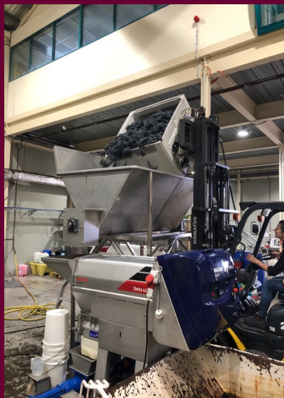
Ton of Mataro, handpicked from the vineyard to the crusher!

A Monthly newsletter from One Lonely Barrel Wines