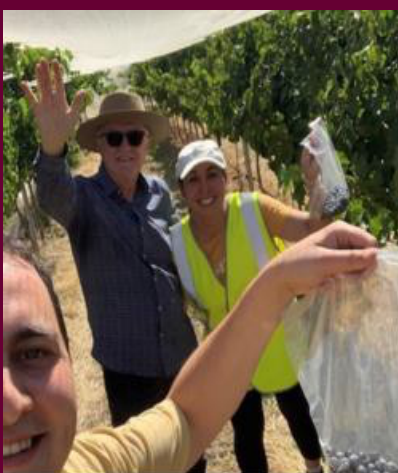
Tasting Mataro grapes

Here is a brief outline of the challenges faced by The Mataro Team to pick the fruit at just the Right Time! After being allocated our one ton of fruit, we performed our first chemical analysis on the 16 th of February 2021. The PH 3.1, TA (tartic acid) 8.9 and Baume (sugar level) 11.0. The results showed high acidity, low sugar and sour to taste. The fruit was from 3–4-year-old Waite vineyard that was facing east-west. The majority of the other vineyards at the Waite Campus are north/south facing! The challenges here were uneven ripening and shadowing with more afternoon sunlight on the north facing side of the rows with shadowing on the southern. Other teams were well on their way with the vintages with white grapes usually first to be ready together with some light bodied reds. The Mataro team anxiously checked the fruit every week and by the 4 th week the analysis showed PH 3.3, TA 7.5 and Baume 12.9 , a long way to go to our targeted Baume of 14-15. After a further 4 weeks, due to cooler than ideal ripening conditions on the 18 th of March we hit 14 Baume and Taste/Flavour improved markedly. We decided to pick the following week, the pressure was on, most if not all other teams had fermented, pressed and processed the fruit. Easter was upon us so we picked our grapes on the 25 th of March, very late. I am out of my allocated space for this segment.....wait until I tell you what happen next! In the April Newsletter.