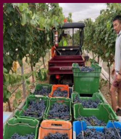
Picking Mataro grapes