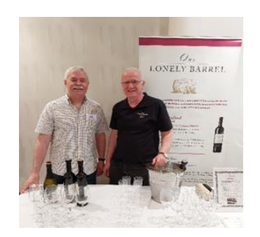
Wine tasting at Support Act