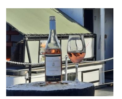
Did someone say Rose'?