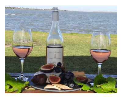
Rose' and a cheese plate what a match!